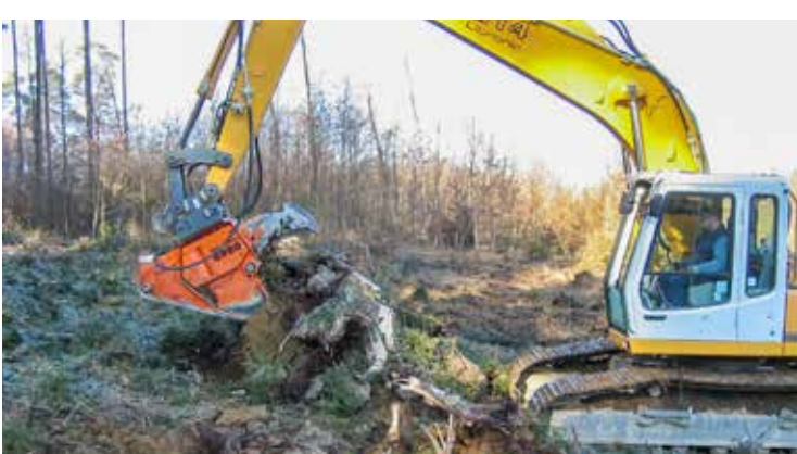
Careful removal of the entire rootstock from the ground.