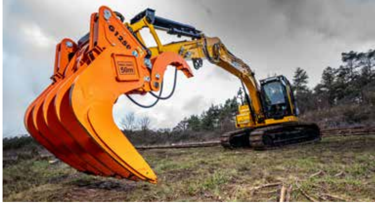
Mountable to all common carrier vehicles.