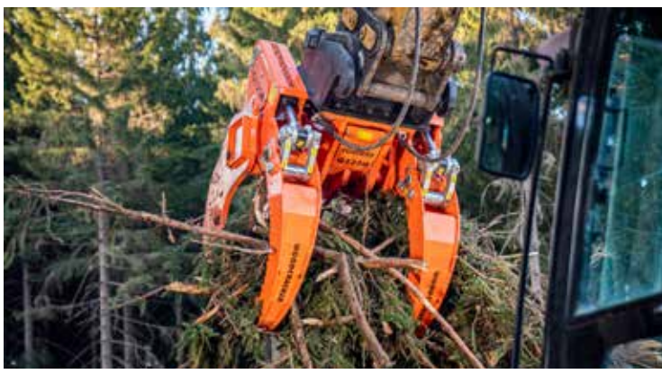
Very large capacity.