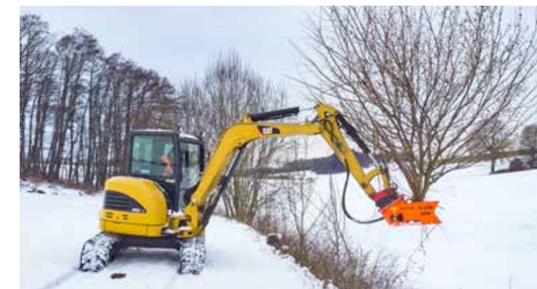
For mini excavators from 2,5t.