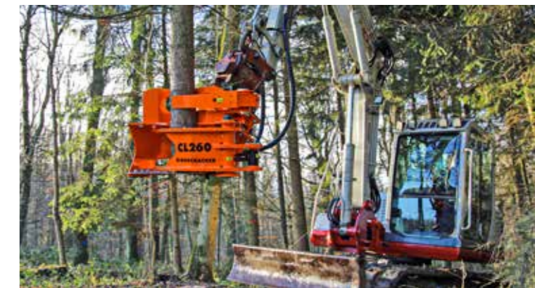
Optional available with accumulator.