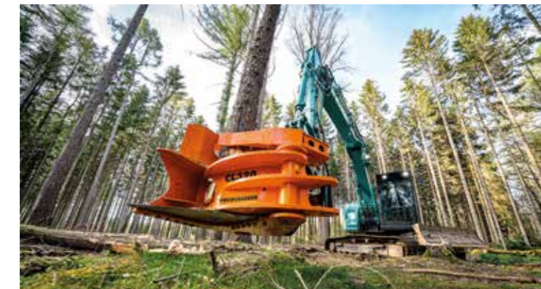
Fast harvest of small trees and bushes.