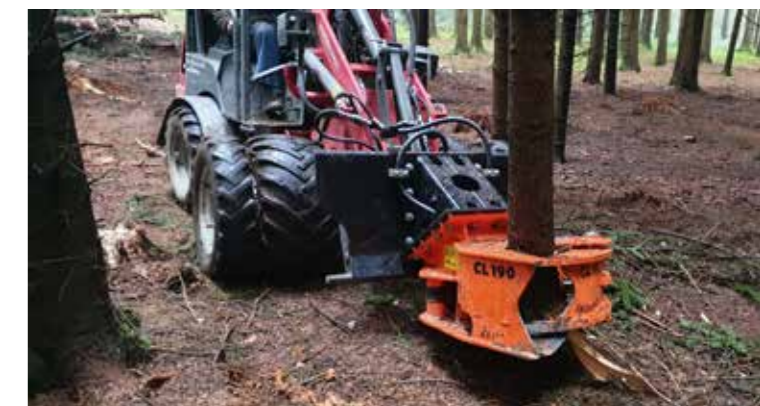
Woodcracker® CL cuts weak wood up to 40 cm.